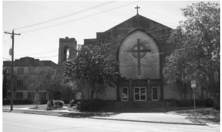
Church of the Redeemer, Episcopal

Eastwood Civic Association Meeting • March 1, 2004 • 7:30 - 8:30 pm • Cape Center