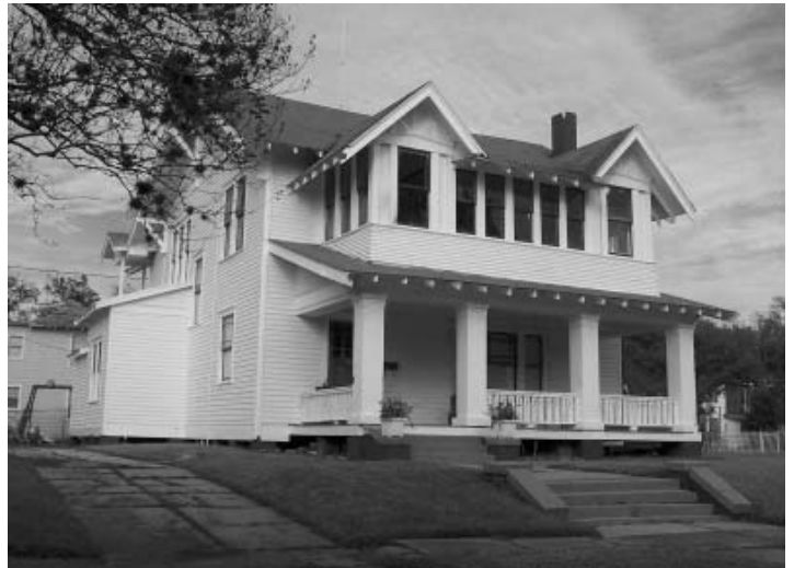
This house on Walker was the 3rd home in Eastwood, built in 1911.

Eastwood Civic Association Meeting • January 5, 2004 • 7:30 - 8:30 pm • Cape Center