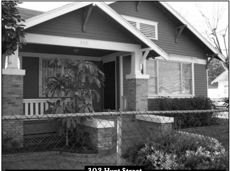
302 Hunt Street

Frost Bank, 1001 Broadway August 14 - September 15 August 17 Reception At 10:00 am 713.388.1152