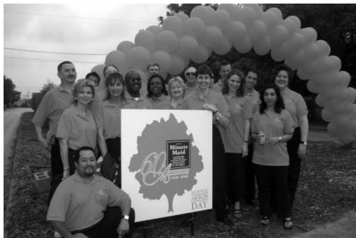
The Minute Maid Ambassadors in a sea of orange!

gift of 60 trees to be planted in the historic Eastwood neighborhood of Houston. This donation of native trees is a living testimony to the company's generous spirit when it comes to our city."